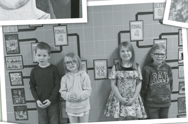
March Madness Tournament of Books at Clinton Elementary.