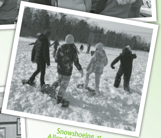
Snowshoeing at Allendale Elementary