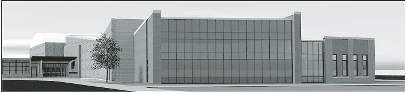
Music Wing addition at West Middle School and the new entry canopy at East Middle School.